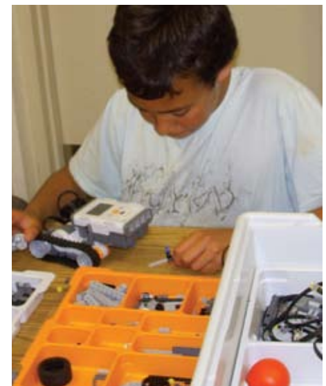
It's not just a car. It's a vehicle for high-tech learning.

With STEM, our students gain an edge and a head start on the path toward future career success in our high-tech, high-skill global economy. Your support of the Peninsula Education Foundation helps us provide excellent programs like STEM at all our schools.