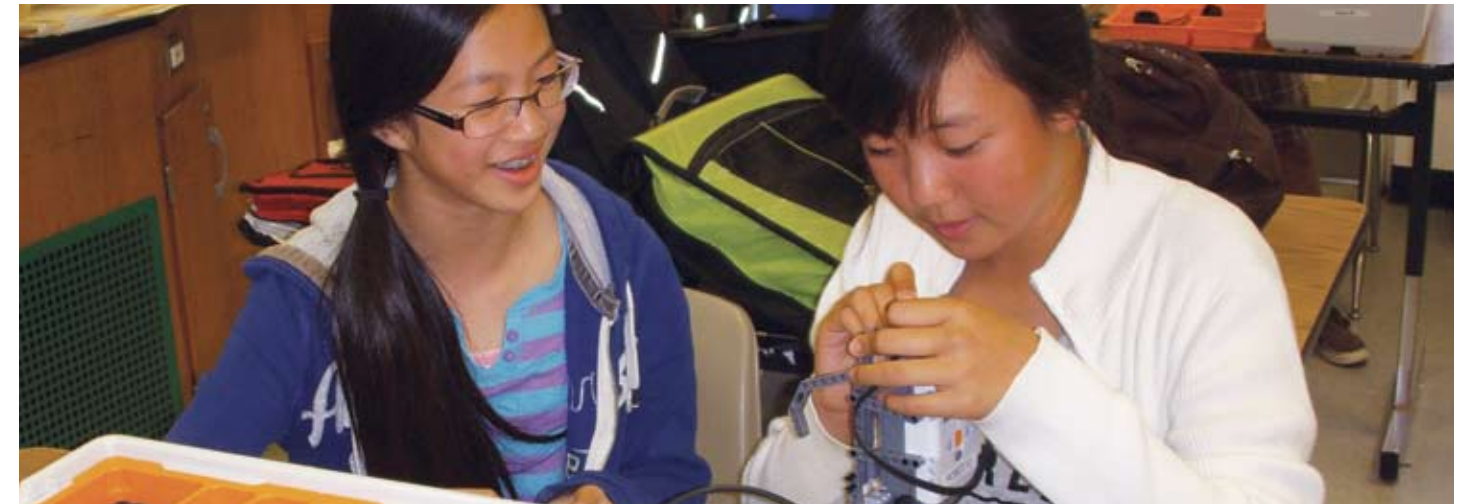
Budding engineers construct Lego robots in after school robotics, part of STEM. The hands-on, innovative curriculum makes students more aware of the field of engineering.

MIDDLE SCHOOL IS A CRITICAL POINT for our students. It's here the seeds of innovation and creativity can truly be sown.