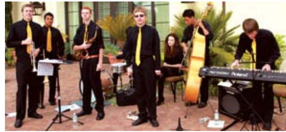
The Peninsula High Jazz Band (as if the colors didn't tip you off).

This year's raffle for a new Lexus RX450h, donated by Toyota Motor Sales USA, also set a record, raising more than $66,000 in ticket sales. The winners: Caroline and